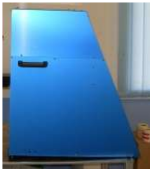
Profile View of Blender cabinet

3 or 4 Inputs for OCTANE 2 Inputs for CETANE